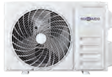
HCNTS 260-350 ZA