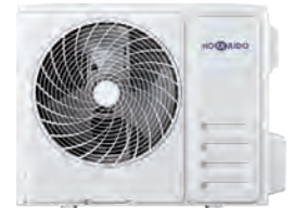
HCNTS 710 ZA