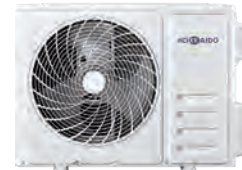
HCNTS 530 ZA