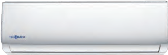
HKETM 260-710 ZAL

Standard remote control with built-in temperature sensor (I-Feel function)